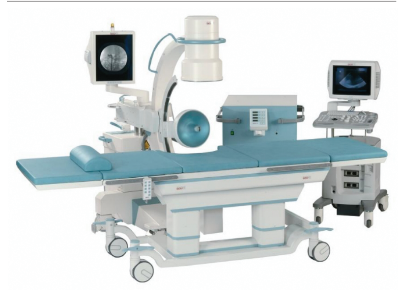
Figure 2: The New Triple-focus and the Double-layer Technology of the Piezolith 3000

Figure 1: Piezolith 3000 - System Overview